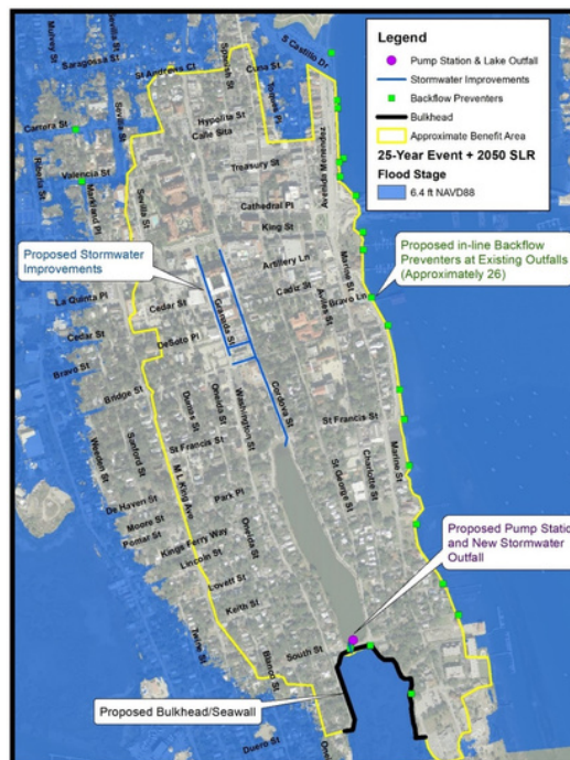
Projected Flood Protection with Project